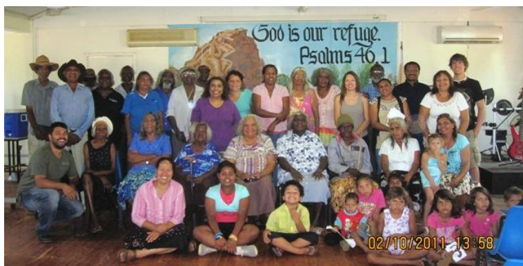
The Halls Creek Peoples' Church