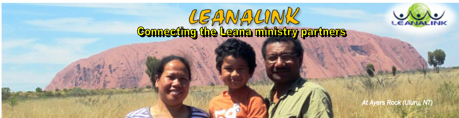
At Ayers Rock (Uluru, NT)