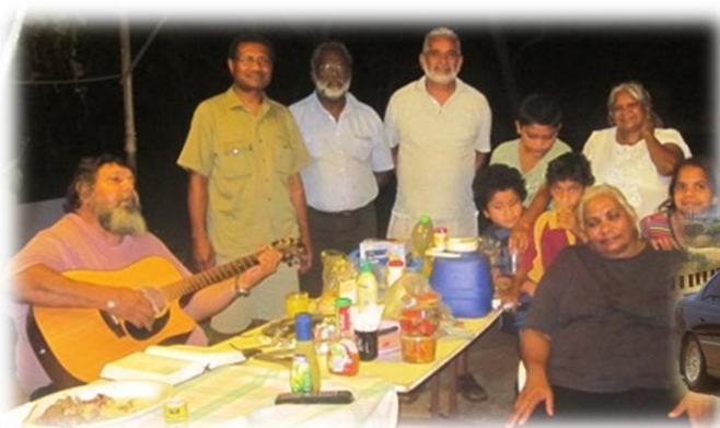
Fellowship at Kununurra Peoples' Church