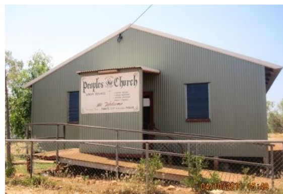
The Halls Creek Peoples' Church building

Our ministry at Halls Creek ended on Sunday the 2 nd of October 2011. Amos preached in the morning and evening services. In the former, the leadership prayed over us before the congregation and bestowed their blessings. We were reminded by the Halls Creek Peoples' Church that we were always welcome there. Thereafter, a love offering was taken. The same was done in the evening service with a fellowship meal and lots of singing. A total of $1,611 was collected to pay for our fuel and accommodation for our return. In all, the Church paid a total of $2,611 for our entire trip to Halls Creek and return to Walgett. We were touched by their love.